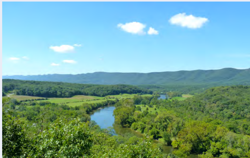
▲ The famous view at Culler's Overlook at Shenandoah River State Park.