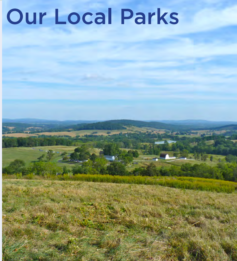
▲ Overlooking Sky Meadows State Park.

National Park entrance fees apply ($15.00 per vehicle), PLUS the event fee for each guided hike: $10.00 for Adults, $8.00 for Children 12 years and under. Visit goshenandoah.com for more information, or call 1-877-847-1919.